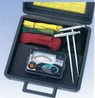
MODEL 4102A-H (Hard Case Model)